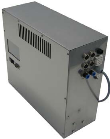
Cooling Booster A300